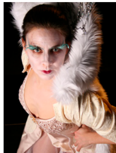
A Contemporary Theatre