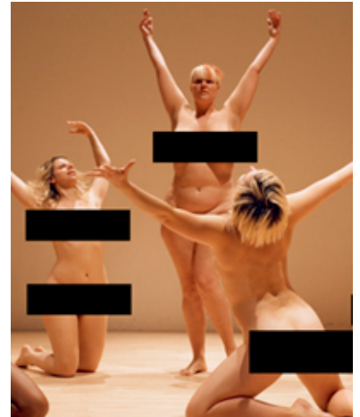
Young Jean Lee's Theater Company