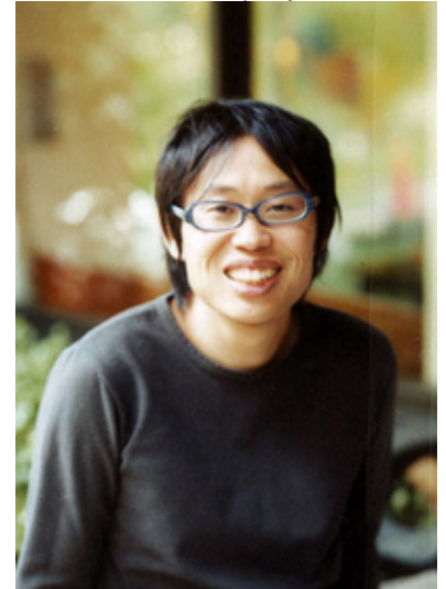
Pig Iron Theatre Company