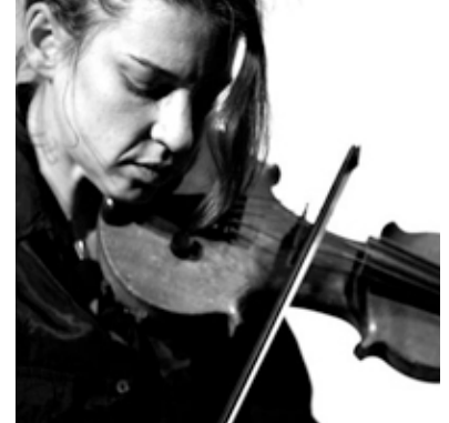
International Contemporary Ensemble