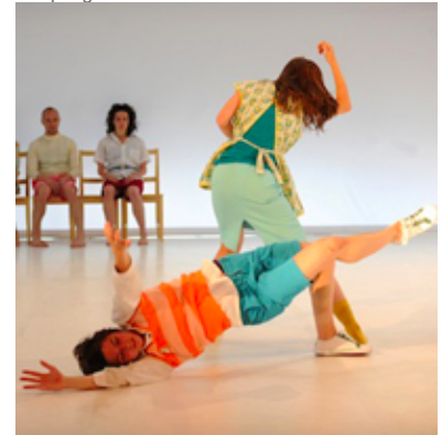
Walker Art Center