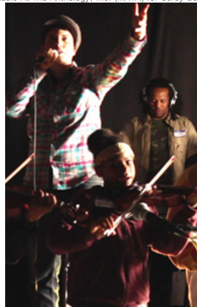
Allied Media Projects, Inc.