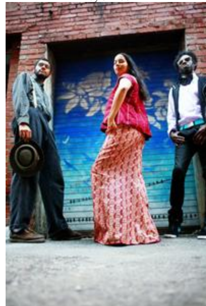
Carolina Chocolate Drops