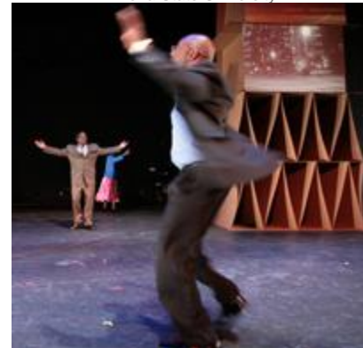
Los Angeles Poverty Department