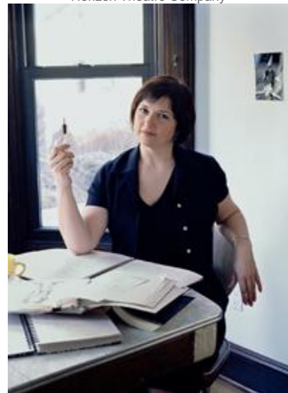
13 Playwrights, Inc.