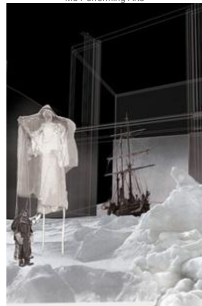
Beth Morrison Projects