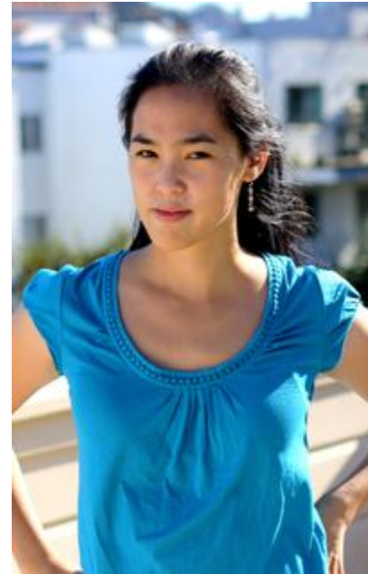
Mu Performing Arts