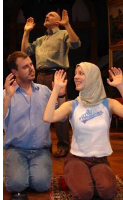
Horizon Theatre Company